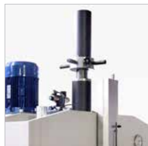
Mechanical regulation of the cylinder