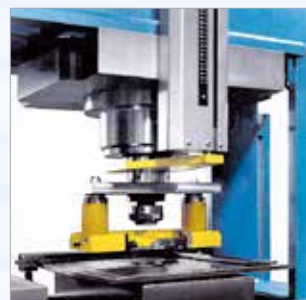
Punching tools set for diameters from 6 mm up to 40 mm with anti-deformation elastic hold-down