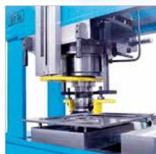
Punching tools set for diameters from 6 mm up to 160 mm