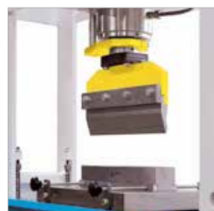
415 mm long folding tools set