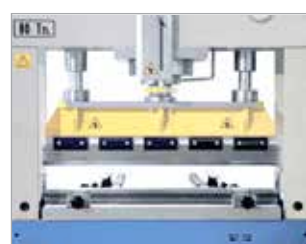
1020 mm long folding tools set