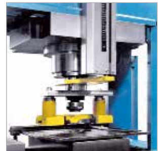
Punching tools set for diameters from 6 mm up to 40 mm with anti-deformation elastic hold-down