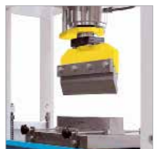
415 mm long folding tools set