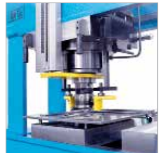
Punching tools set for diameters from 6 mm up to 160 mm.